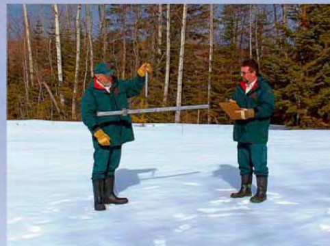
Sampling tube is weighed to determine moisture content