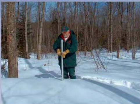
Sampling tube is forced into the snow pack to measure depth

Snow survey sites are laid out throughout the watershed to better anticipate the magnitude of spring melt water.